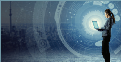
Autonomous Wave Control (AWC)